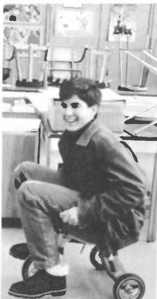
by trike ...