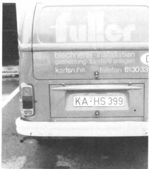
by van ...