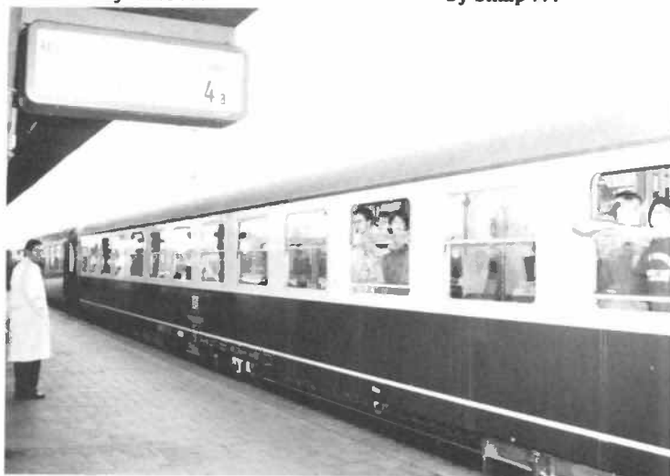
by train ...