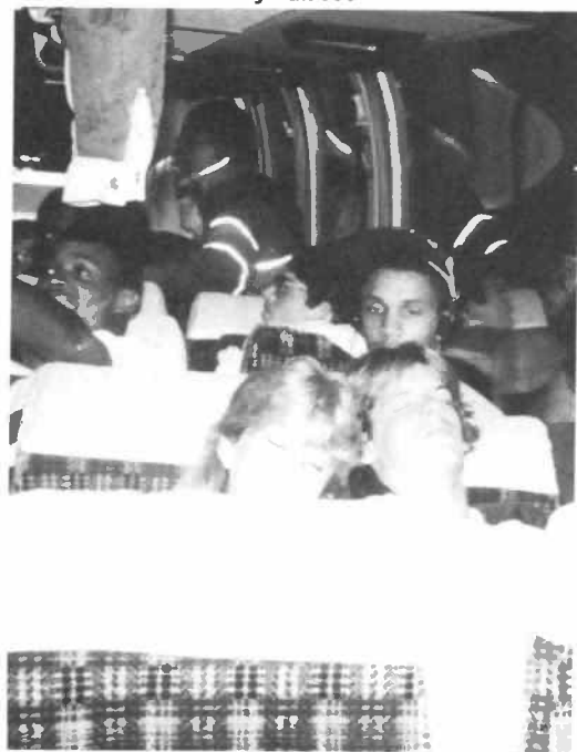
by bus ...