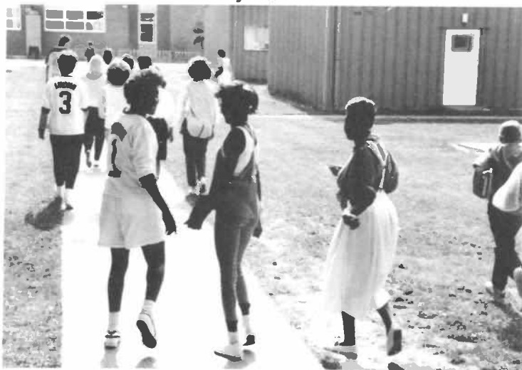
or by foot ...