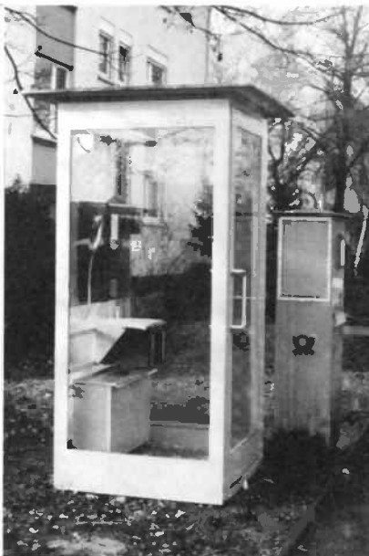
Phones can confuse ...