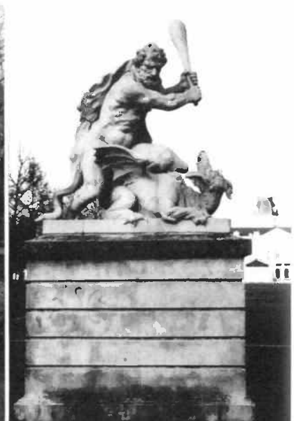
Statue and Schloss ...