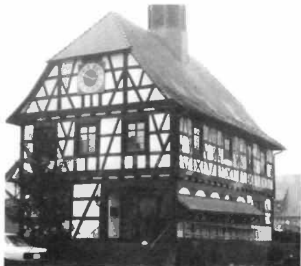
A half-timbered house and chess in the park.