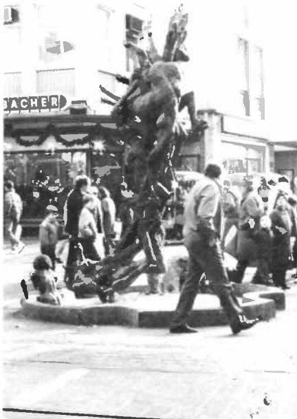
Fountains abound ...