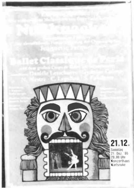
Ballet is possible ...