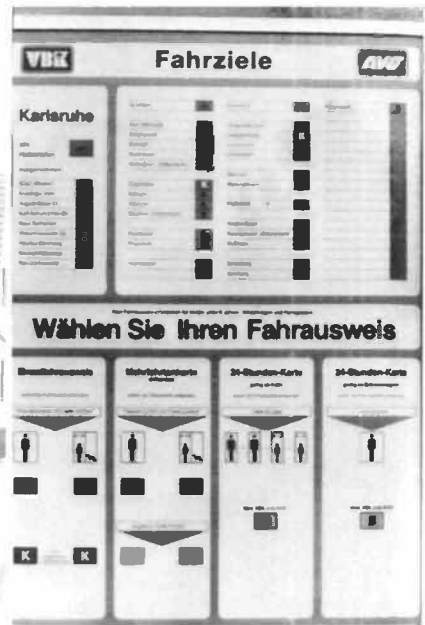
Tried buying a strasse ticket?