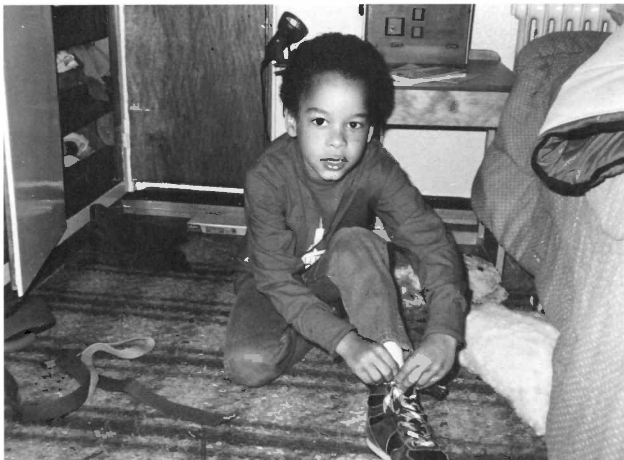
At this time in the morning, who can tell a left shoe from a right.