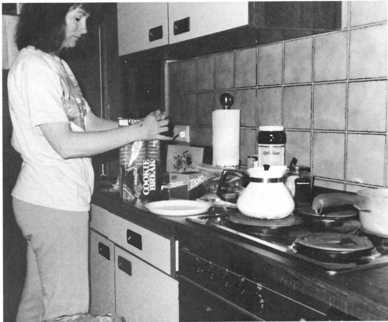
Mom meets her tight schedule by fixing breakfast and lunch for her family at the same time.